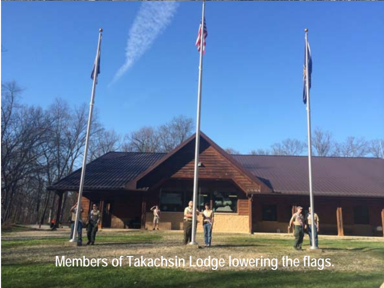
Members of Takachsin Lodge lowering the flags.